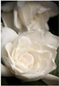
Everblooming Gardenia (Grafted)

Gardenia jasminoides 'Veitchii' (Grafted onto G. thunbergia) Item #3781 Showy, Fragrant Flowers