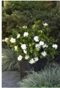
August Beauty Gardenia (Grafted)

Gardenia jasminoides 'Veitchii' (Grafted onto G. thunbergia) Item #3781 Showy, Fragrant Flowers