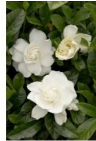
First Love® Gardenia (Grafted)

Gardenia jasminoides 'Mystery' (Grafted onto G. thunbergia) Item #3759 Improved Grafted Selection