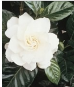
Mystery Gardenia (Grafted)

Gardenia jasminoides 'August Beauty' (Grafted G. thunbergia) Item #3415 Showy, Fragrant Flowers