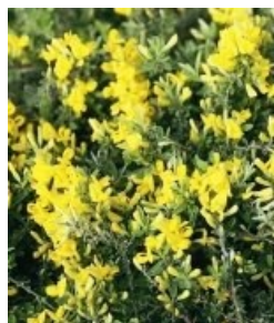
Gold Flash Broom

Spiraea nipponica 'Snowmound' Item #7130 Spectacular Spring Bloomer