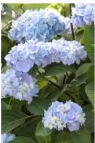
Blue Enchantress® Hydrangea

Hydrangea macrophylla 'Monmar' Plant Patent #25,209 Item #9275 Showy Repeat Bloomer