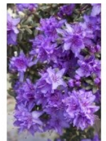
Dwarf Purple Rhododendron

Leptodermis oblonga Item #2077 Prolific Bloomer