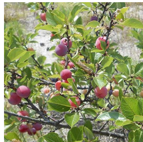
Beach Plum Zone: 3 - 7

Vigorous, twining vine with dangling stalks of strongly fragrant white flowers followed by edible purple fruit. Full to partial sun. Up to 20 ft. long. Semi-evergreen.