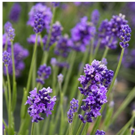
Thumbelina Leigh English Lavender Zone: 5 – 9

Grow it for the foliage, and get edibles too. Large silvery-green leaves create a fountain-like form. Great in containers. Full sun. Up to 5 ft. tall and wide. Herbaceous.