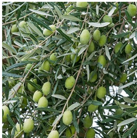
Hass Improved Manzanillo Fruiting Olive Zone: 8 – 11

Flowers are an awesome edible...and so pretty too. Compact, aromatic, produces blooms up to 3X per year! Full sun. Up to 1-1/2 ft. tall and wide. Evergreen.