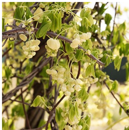
White Flowered Chocolate Vine Zone: 5 - 9

Pasta sauce must-have! More compact sweet bay with aromatic, edible foliage on red stems. Thrives in containers. Partial to full sun. Up to 8 ft. tall and wide.