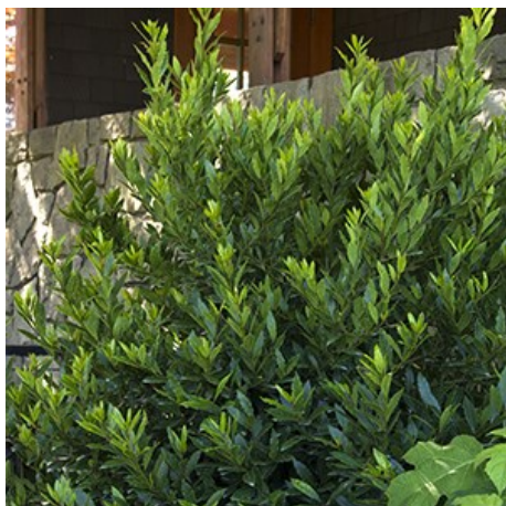
Little Ragu® Sweet Bay Zone: 8 - 11

Pale pink, single blooms blanket the stems in the spring before the foliage emerges. Coppery purple foliage holds its color into fall. Produces small, red edible fruit. Full sun. Up to 20 ft. tall and wide. Deciduous.