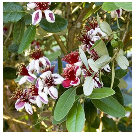
Pineapple Guava Zone: 8 – 10

If you live in a warmer zone and have the room, this fruiting olive tree brings all kinds of romance to the garden. Full sun. Up to 20 ft. tall and 15 ft. wide. Evergreen.