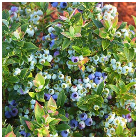
Jelly Bean® Blueberry Zone: 4 – 8

Variety was bred for eating (tastes like asparagus). Harvest leaves and stems young for salad. Full shade to filtered sun. Up to 2 ft. tall and 3 ft. wide. Herbaceous perennial.