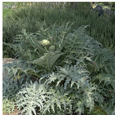
Improved Green Globe Artichoke Zone: 6 – 11

Even if they didn't bear delicious fruits, modern blueberries are a tidy, pretty shrub with lovely fall foliage. Partial to full sun. Up to 2 ft. tall and wide. Deciduous.