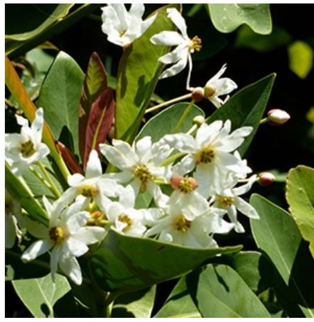
Pewter Pillar® Winter's Bark Zone: 7 – 10

One of the first to bloom, an explosion of small pink clusters brightens the garden, and attracts butterflies and hummingbirds. Up to 3 ft. tall and 4 ft. wide. Full sun.