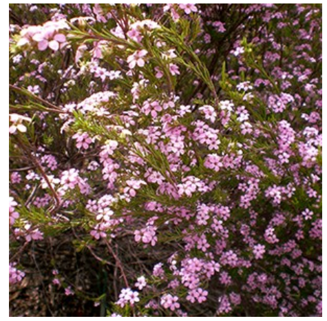
Magenta Breath of Heaven Zone: 8 – 10

Need a impressive evergreen hedge that puts on a fantastic late winter floral show ? Check this find from Dan Hinkley. Up to 20 ft. tall and wide. Partial to full sun.