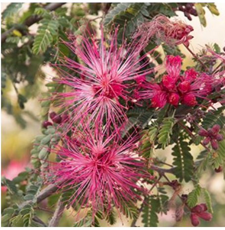
Pink Fairy Duster Zone: 7 – 11

One of the first to bloom, an explosion of small pink clusters brightens the garden, and attracts butterflies and hummingbirds. Up to 3 ft. tall and 4 ft. wide. Full sun.