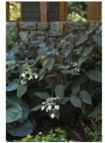
Plum Passion® Hydrangea

Aucuba japonica 'Mr. Goldstrike' Item #0356 Bright Foliage for Shade