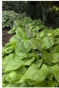
Sum and Substance Hosta

Dryopteris erythrosora 'Brilliance' Item #2122 Dramatic Foliage Color