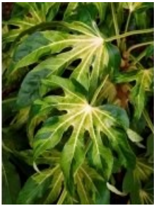
Camouflage™ Variegated Japanese Aralia

Fatsia japonica 'Variegata' Item #3303 Bright Foliage for Shade