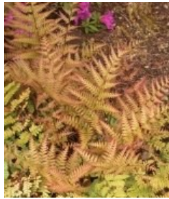
Brilliance Autumn Fern

Fatsia japonica 'Variegata' Item #3303 Bright Foliage for Shade