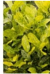
Mr. Goldstrike Aucuba

Hosta x 'Sum and Substance' Item #8397 Dramatic Foliage Color