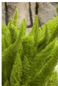
Foxtail Fern Asparagus densiflorus 'Myers' Item #0315 Year-round Interest