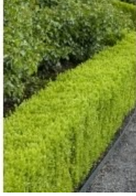
Dwarf English Boxwood

Nepeta x faassenii 'Walker's Low' Item #6228 Easy Care and Colorful