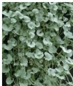
Silver Falls Dichondra Dichondra argentea 'Silver Falls' Item #31188 Trailing habit