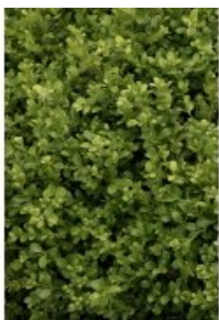
Green Beauty Boxwood Buxus microphylla japonica 'Green Beauty' Item #1395 Evergreen Hedge Plant