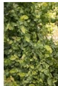
Creeping Fig Ficus pumila Item #3685 Self-Clinging Vine