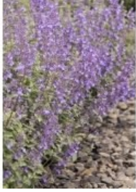
Walker's Low Catmint

Nepeta x faassenii 'Walker's Low' Item #6228 Easy Care and Colorful