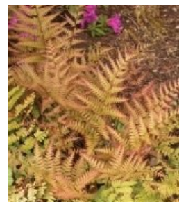
Brilliance Autumn Fern Dryopteris erythrosora 'Brilliance' Item #2122 Dramatic Foliage Color